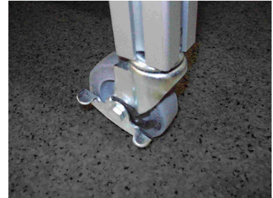
Locking castors offer mobility when needed

QTS, Inc. manufactures 3 standard racks but will custom design a rack specific for your needs. Our injection molded guides can be machined removing 1 rib for a 1x24x24 frame or removing 2 ribs so a 1.5 x 29 x 29 can be accepted. We have custom manufactured many racks and would be happy to quote your needs. You can also purchase our injection molded guides separately.